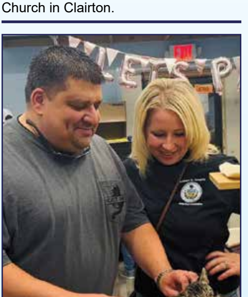
Petting a four-legged friend during the opening of cat rescue Fur All Kittys in West Mifflin.